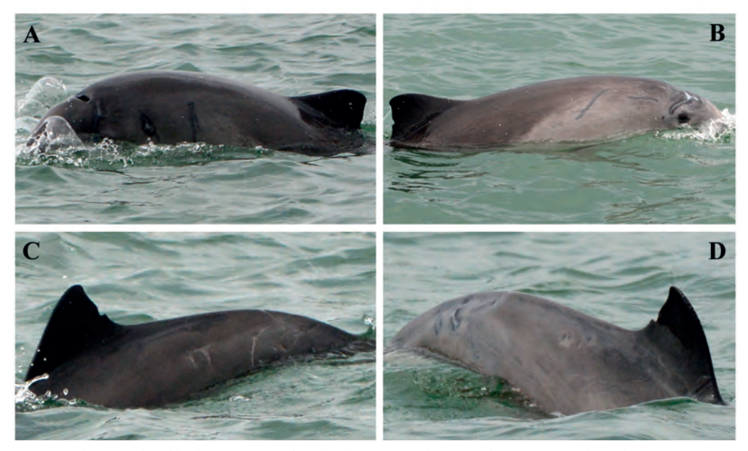
Figure 2. Photographs of harbour porpoise 'HP2', taken on 30 July 2016.