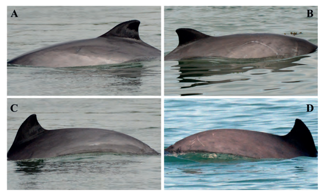
Figure 1. Photographs of harbour porpoise 'HP1', taken on 22 July 2016 (A, B, C), and 30 August 2016 (D).

individual was photographed again in 2015, with healed scars visible on its flanks and bilaterally on the tailstock. There was a notch on the dorsal side of the tailstock with bilaterally healed scars (figure 1C and 1D). There were two large scars on the right lateral side, one of which seems to extend towards the ventral side (figure 1B). Smaller scratches were present around the horizontally curved scar. There were five re-sightings of this individual in the summer of 2016. The animal obtained two new minor markings on its left lateral side in 2016, close to the already present scars (figure 1A).