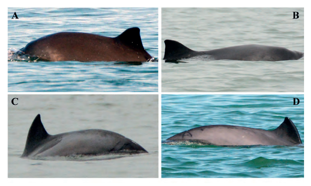
Figure 4. Photographs of harbour porpoise 'HP4', taken on 19 August (B, C), 30 August (A), and 31 August 2016 (D).

the dorsal side of the tailstock (figure 4D). A small indentation cranial to the dorsal fin became apparent in 2014 (figure 4B).