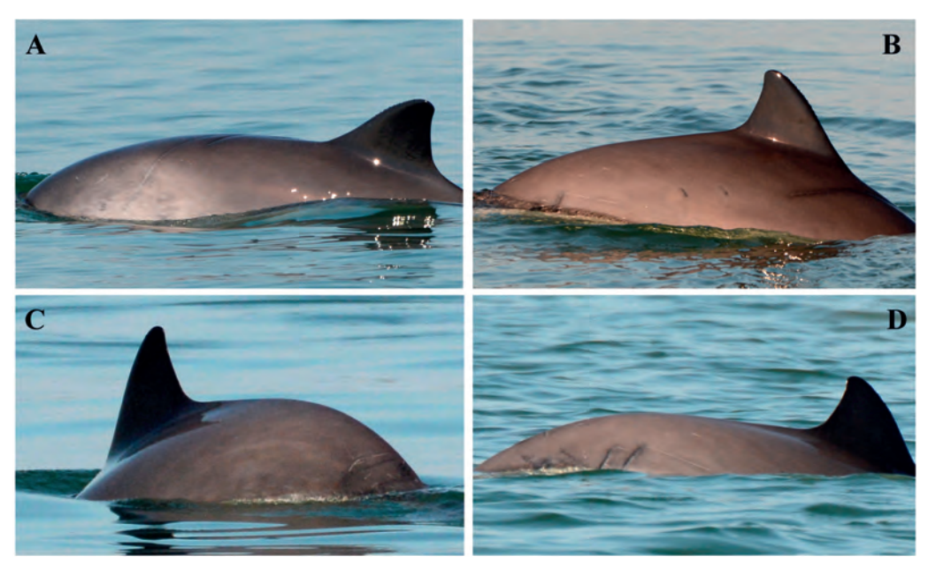
Figure 3. Photographs of harbour porpoise 'HP3', taken on 30 August 2016 (B, C), and 31 August 2016 (A, D).

four re-sightings in 2016. Markings on the tailstock were photographed for the first time in 2015, and were not present during the sighting in 2014. This individual had a notch on the